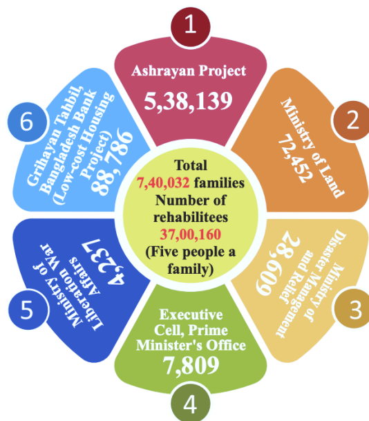
Figure 2 Homeless families rehabilitated through various ministries from 1997 to 2022, including through the Ashrayan project.