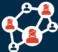
ECOSYSTEM OF STAKEHOLDERS

The national consultation in collaboration with Agency of Enterprise Development, Ministry of Planning and Investment (AED-MPI) as the lead implementation partner, brought together more than 100 stakeholders from across the public and private sector. The national consultation served to map the ecosystem of stakeholders working to advance women's entrepreneurship, and facilitated a diverse dialogue around the opportunities and challenges faced by women entrepreneurs in Viet Nam. In particular, this identified specific areas of policy and advocacy to be focused on to advance women's entrepreneurship in Viet Nam. The press release from the event can be found here .