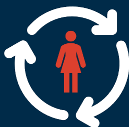
EVIDENCE-BASED PRIORITY ACTIONS

An in-country Technical Advisory Group (TAG) was established. The first TAG meeting chaired by Ministry of Planning and Investment and UN ESCAP witnessed more than 30 representatives from Government ministries, financial institutions and women's associations , resulting in the formalisation of a multi-stakeholder mechanism for engagement beyond the traditional gender machineries. Key interventions needed in the policy domain to advance women's entrepreneurship were identified. It was agreed that this group will meet twice a year to advance women entrepreneurship agenda in the country.